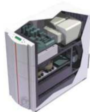
LP11U Series UPS 5 - 10 kVA