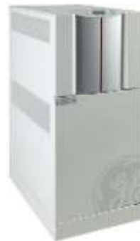
LP33 Series UPS 10 - 40 kVA