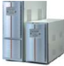
Digital Energy GT Series UPS 1000 - 3000 VA Tower or Rackmount Models