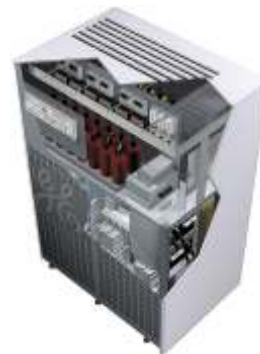
Digital Energy SG Series UPS 10 - 500 kVA